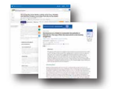
Journal articles Published in national and international papers

FT Opinion A condensed and swift reaction to the moves of the daily economic policy and trends