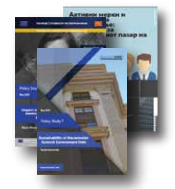
Policy studies Results and recommendations from each research are presented in a policy study format