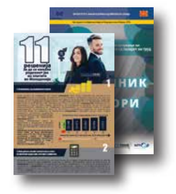
Other publications Policy memo, Show-card, Brochures, Posters and Leaflets