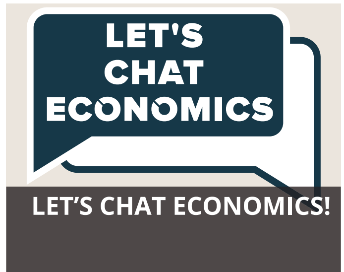
Let's chat economics!