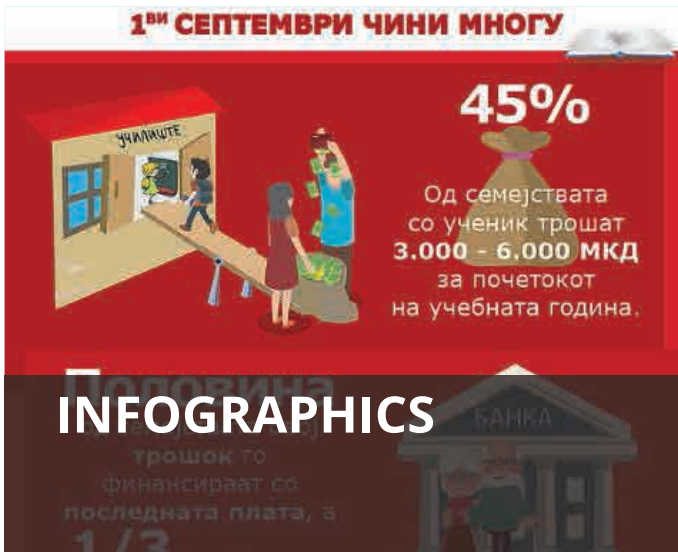
Info-graphs Gives information on a specific economic issue, through a one-page poster