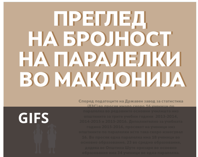
GIFs Graphics Interchange Format which gives information on a new innovative way