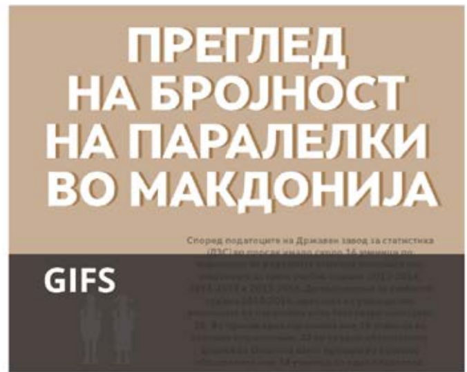
GIFs Graphics Interchange Format which gives information on a new innovative way