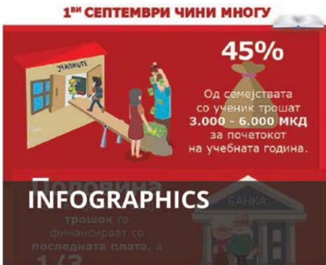
Info-graphs Gives information on a specific economic issue, through a one-page poster